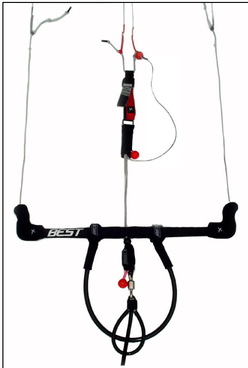
How to Re-Attach the Main Release